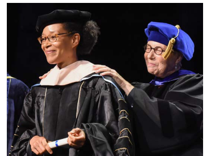
CUNY SPH COMMENCEMENT, HELD AT THE APOLLO ON 125th STREET IN HARLEM.

Supporting them from the start of their education becomes foundational in their ability to serve and contribute meaningfully not only to our city in the public, non-profit and private sectors, but also as entrepreneurs driving innovation, policy and change.