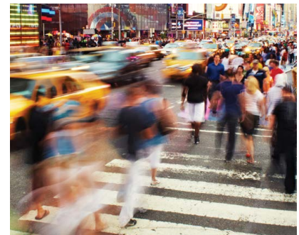
CUNY SPH COMMENCEMENT ATTENDEES, OUTSIDE HARLEM'S APOLLO THEATER